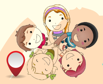
3. Make a team, divide work and fix a collection center