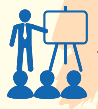
8. Organize Seminars