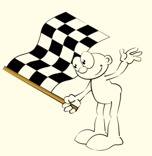
1. So, are you ready?