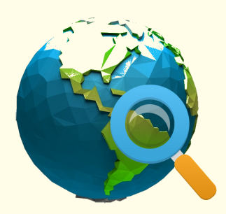
4. Look for supporting organizations