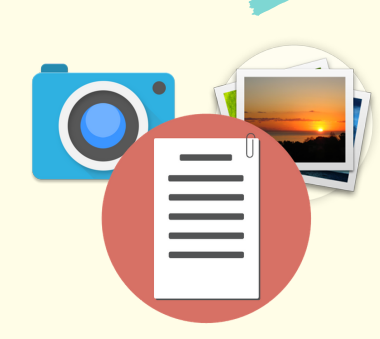
11. Send the seminar photos, videos and registration forms